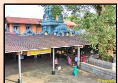
Anegudde Sri Vinayaka Temple