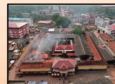
Kollur Mookambika Temple