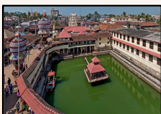
Sri Krishna Temple, Udupi