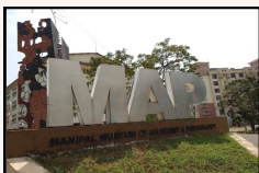
Manipal Anatomy and Pathology Museum