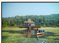
Varanga Jain Temple