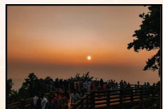
Agumbe Sunset View Point